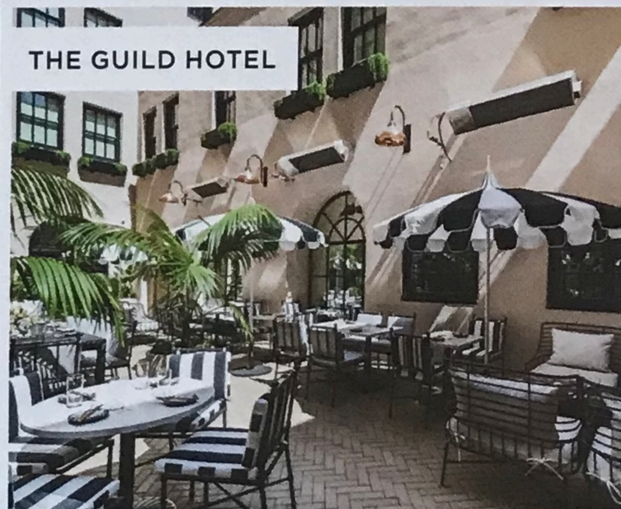
THE GUILD HOTEL

Country chic and coastal classic coalesce at this recently reimagined 50-year-old Moonstone Beach motor lodge in Cambria. Rooms and public spaces are now awash in plaids, Arcadian patterns, white-washed brick and antiques. On the 9 cypress-dotted acres, there are multiple outdoor venues of varying sizes and states of manicure. One is a legit meadow, complete with a windmill to the side of the private trail leading to the sand, where you can also stage a soiree. Features vary from space to space, but can include lawn games, a water tower, a footbridge, light strands, fire circles, fake calf-roping stations, a food truck and Adirondack chairs. The Canteen provides a quaint indoor option for a winter wedding. Kitchen-equipped suites that sleep six, a game room, s'more kits for purchase and a heated pool make this a good choice for pairs who are already parents or have several young guests attending.