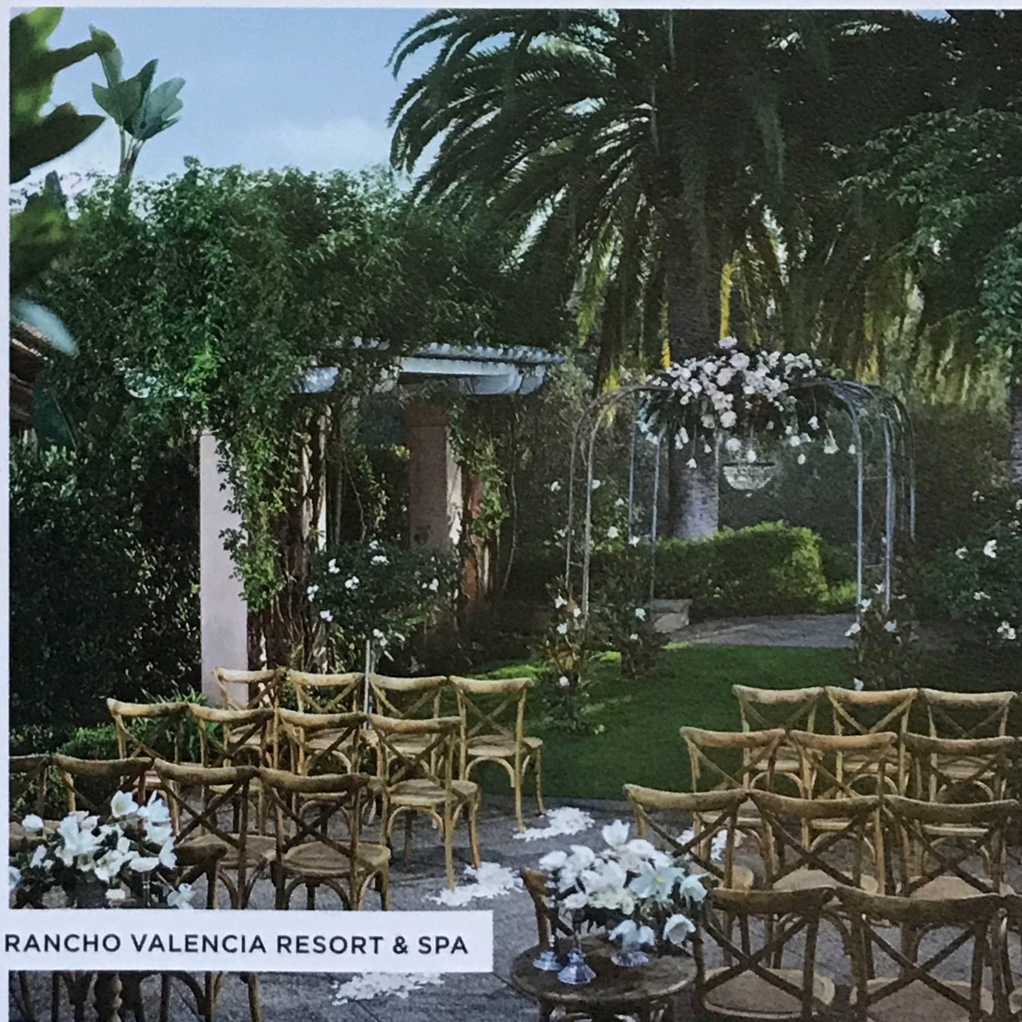
RANCHO VALENCIA RESORT & SPA

Set on 45 ambrosial acres, this Rancho Santa Fe resort delivers rustic romance with tiled patios, immaculate lawns surrounded by bougainvillea and towering palms, and the open-beamed ceilings of great rooms, which have been punched up with wrought iron, autumnal shades and French doors. Its 49 casitas are miniature haute haciendas with all the bells and whistles (daily delivery of freshly squeezed juice, plus fireplaces, 600 thread count linens and soaking tubs). It can host as many as 500 guests, but also offers excellent elopement and vow renewal packages. The Pony Room stocks 100 kinds of tequilas, which can be used for inventing signature drinks or custom tastings.