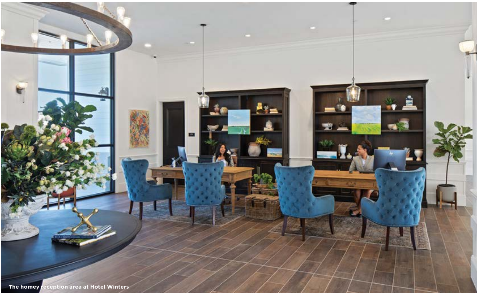
The homey reception area at Hotel Winters